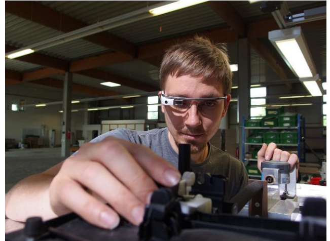
Figure 3: Assembly process with xMake running on Google Glass

tem allows a worker e.g. to pick at one day and to perform assembly on the next day.