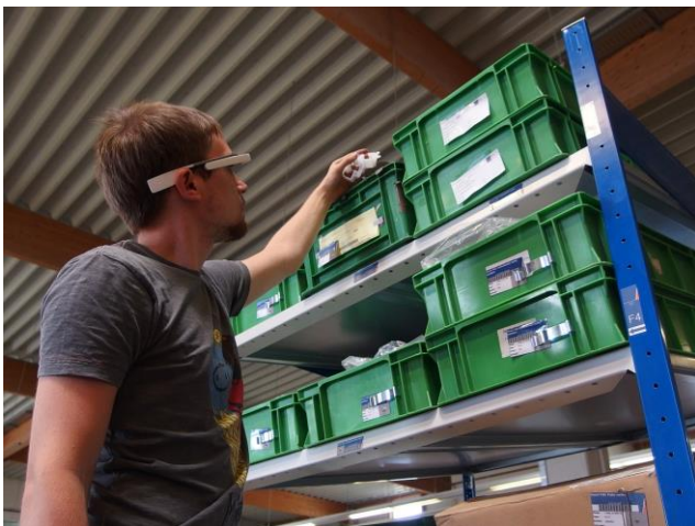
Figure 2: Order picking with xPick and Google Glass

WS now deploys the market leading pick-by-vision solution xPick with Google Glass for its order picking processes. Thereby, the worker logs in with his or her user profile and the picking steps are displayed directly via an intuitive graphical user interface, showing the worker what to pick. The pick step confirmation can either be done by gesture control or voice commands. Once the pick step is done correctly / is confirmed, the information is saved in real-time in the Warehouse Management System (WMS) and the next pick step(s) appears on the display.